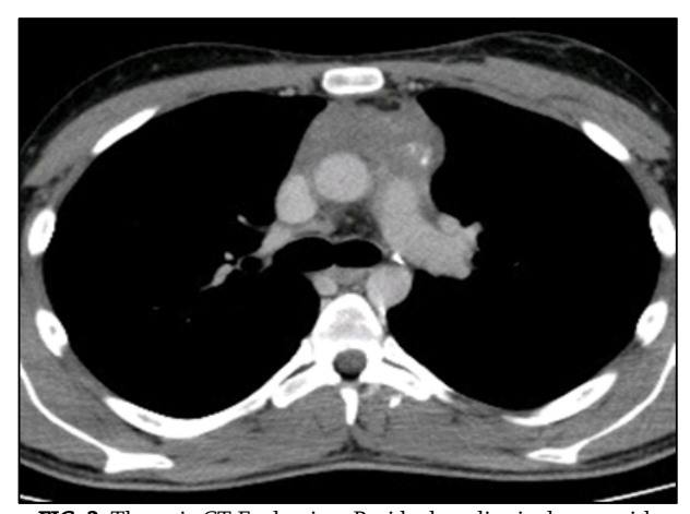
FIG. 2: Thoracic CT Evaluation. Residual mediastinal mass with internal calcifications.

The CT evaluation after six months showed further volume regression of the disease with residual mediastinal mass of 25 \times 38 mm (Figure 2).