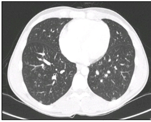
FIG. 3: Monitoring thoracic CT. Bilateral, multiple cavitary lung lesions.

During the monitoring, in the CT of March 2013 (eight months after ending the chemotherapy) multiple and bilateral cavitary lung lesions appeared with signs of rapid growth ( Figure 3 ). PET-CT confirmed these findings and informed of an abnormal metabolism in a lymph node of the right hilum, suggesting a metastatic affectation.