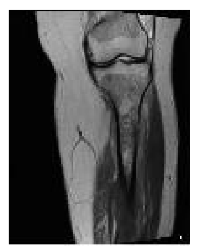
FIG. 2 : In MRI radiography a single osteolytic lesion could be seen in the diaphyses of the left tibia.